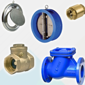
NON RETURN VALVES